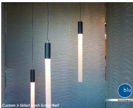
Custom 3-Sided Mesh Scrim Wall