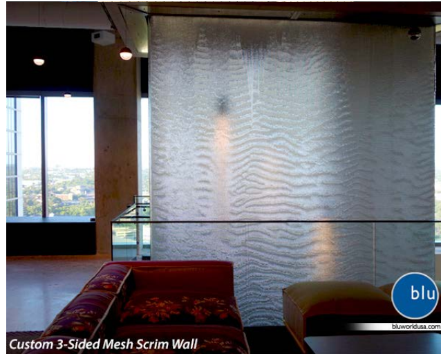
Custom 3-Sided Mesh Scrim Wall